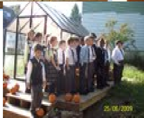
Member schools in Queens, Brooklyn, and Staten Island